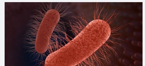
Figure 3: Clostridium

Quorum quenching is the mode of action that can disrupt the quorum sensing system through degradation of quorum sensing signaling molecules, the inhibition of signal biosynthesis and the inhibition of signal detection. 9 Quorum quenching also aids in the prevention of toxin production and formation of biofilm. 3 B. subtilis PB6 can prevent quorum sensing of C. perfringens .