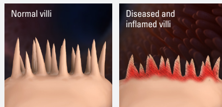
Figure 2: Gut inflammation

B. subtilis PB6 secretes cyclic lipopeptide surfactins through normal metabolism to reduce inflammation.